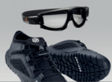
SEA-DOO RIDING SHOES & GOGGLES (OPTION)