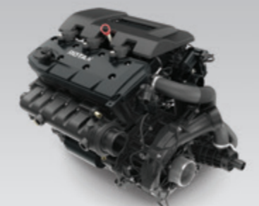
ROTAX® 1630 ACE™ ENGINE