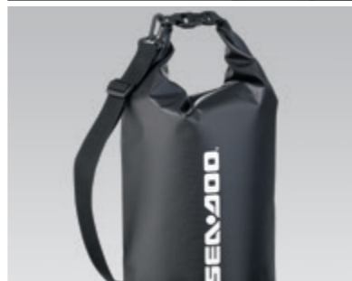
SEA-DOO DRY BAG (OPTION)