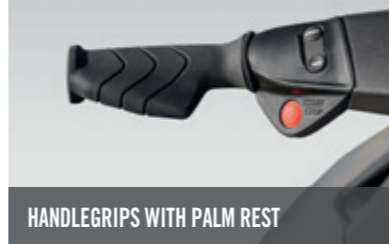
HANDLEGRIPS WITH PALM REST