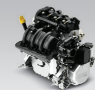
ROTAX® 900 HO ACE™ ENGINE

Type GTI • Medium-sized platform • Moderate V hull • Forgiving and nimble