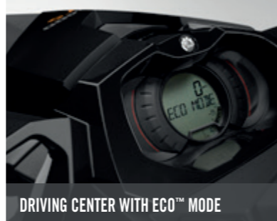
DRIVING CENTER WITH ECO™ MODE