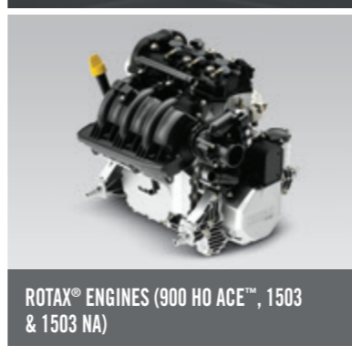
ROTAX® ENGINES (900 HO ACE™, 1503 & 1503 NA)