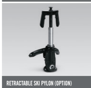
RETRACTABLE SKI PYLON (OPTION)