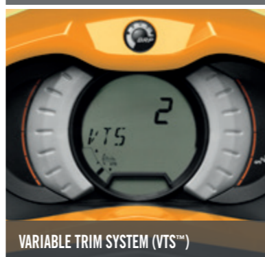
VARIABLE TRIM SYSTEM (VTS™)