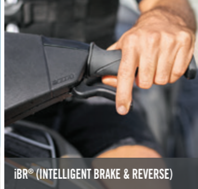
iBR® (INTELLIGENT BRAKE & REVERSE)